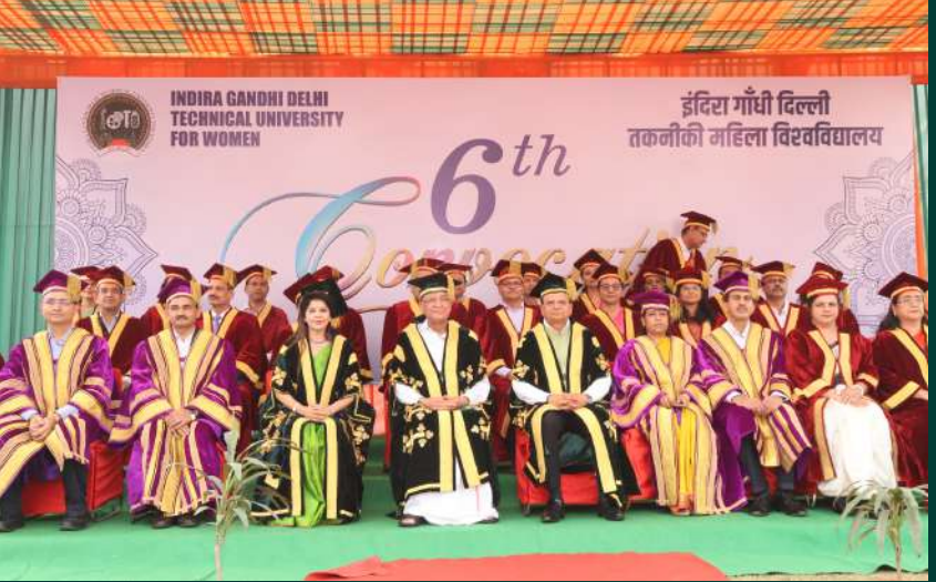
6TH CONVOCATION OF IGDTUW

AT INDIRA GANDHI DELHI TECHNICAL UNIVERSITY FOR WOMEN (IGDTUW), OUR DYNAMIC SPORTS EVENTS ENCOURAGE PHYSICAL FITNESS AND TEAMWORK.